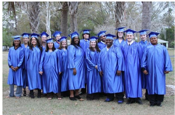
The commencement exercise for the YouthBuild Class of 2013 was held in partnership at the Coleman-Bush Community Center. YouthBuild is one of the facets of LHA's Community and Supportive Services arena.

Now is the time when we especially appreciate our partners around the community for all that they do each and every day. Without them, the impact of sequestration would be even more severe. Bear with us as we work through this trying time.